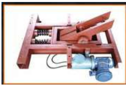
Electrical mine car stopper