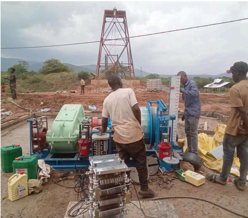
Mine headframe construction and winch installation and commissioning