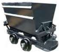
Bucket tipping mine car