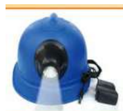
Mine lamp cap