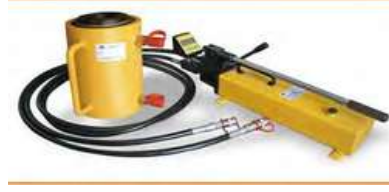
Hydraulic anchor cable tensing machine