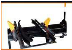
Manual mine car stopper