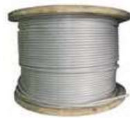
Steel wire rope