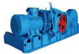
Double speed winch