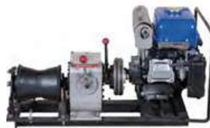
Cable pulling winch