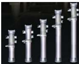
Single hydraulic prods