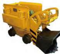
Electrical rock loader