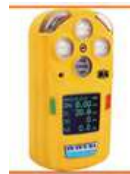
Multi gas detector