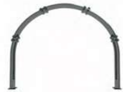
Standard semi circular arch bracket