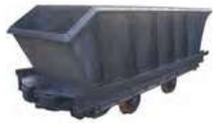
Bottom discharge mine car