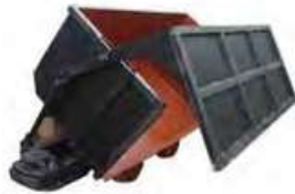
Side discharge mine car