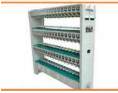
Mine lamp charging rack