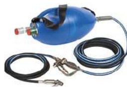
Jack pot pump