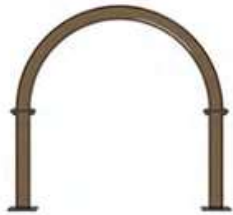
Miner steel bracket