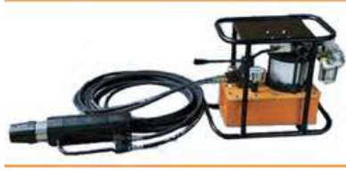
Pneumatic anchor cable tensing machine