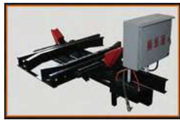
Pneumatic mine car stopper