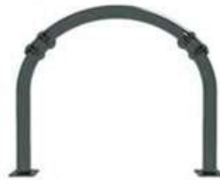
Single section beam