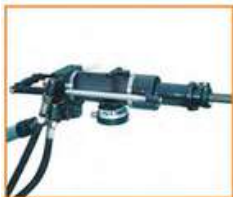
Hydraulic rock drill